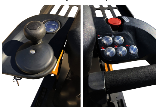
Left hand controls

The right-hand operator control pod features fingertip lift/lower buttons for the operator platform, front load tray, horn, and travel. Also included is a recessed emergency power disconnect. On the left-hand control pod, the steering tiller, battery discharge indicator with hour meter and key switch are provided.