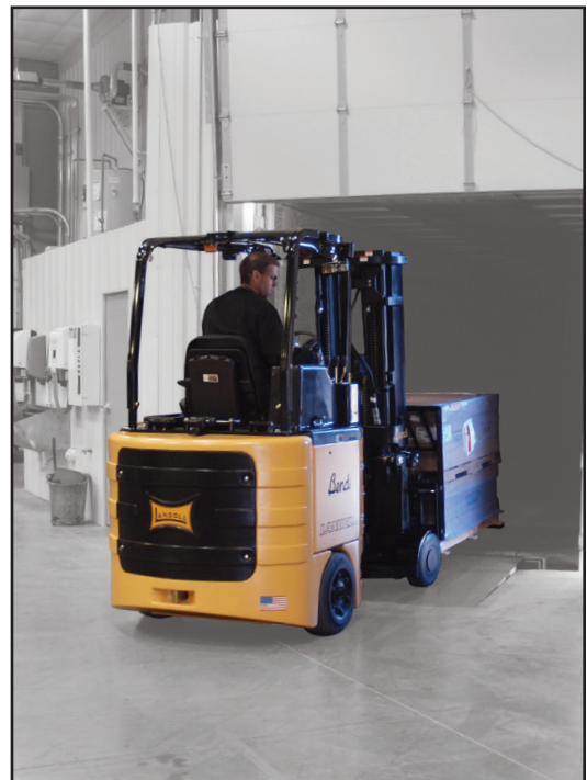
Loading / Unloading