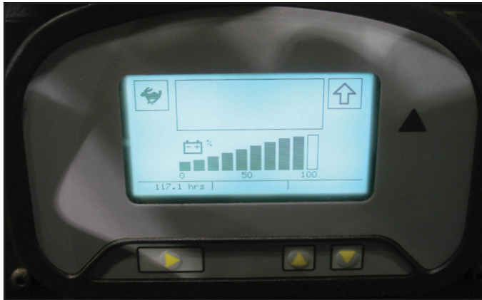
Dash Display with Full Diagnostics Battery Discharge Indicator and Hour Meter