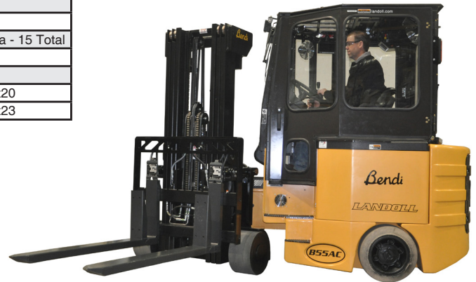
*Optional Cab Shown